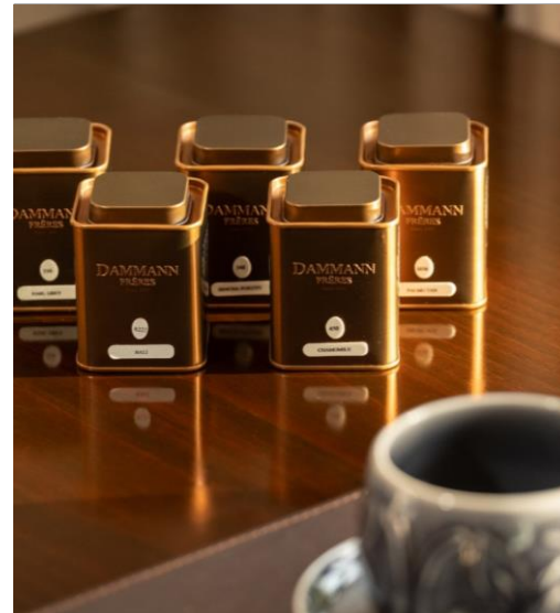
DAMMANN TEA TIN