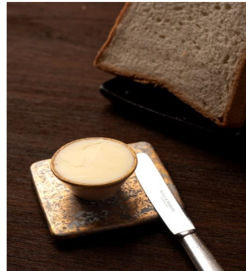
CERAMIC CONDIMENT HOLDER