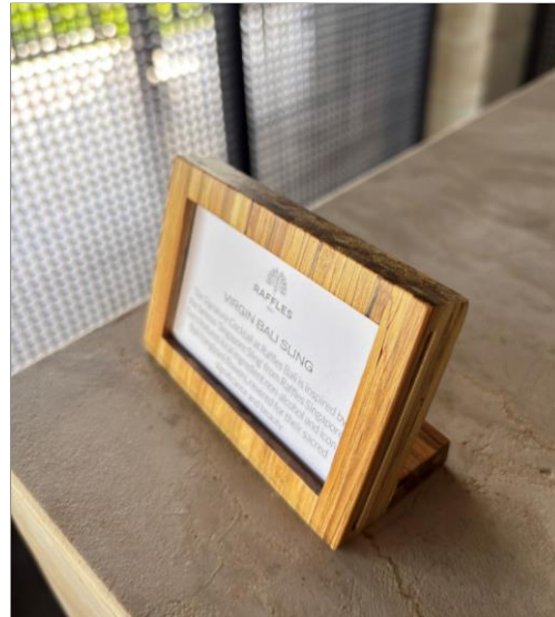
RECYCLED CHOPSTICK CARD HOLDER