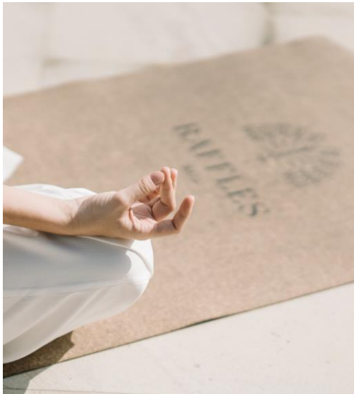
RECYCLED CORK YOGA MAT